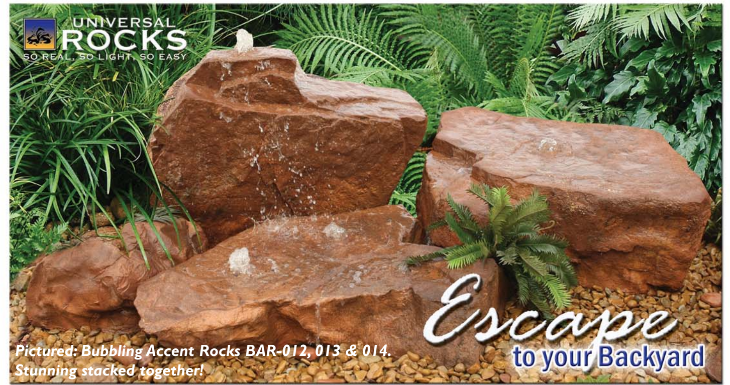
Pictured: Bubbling Accent Rocks BAR-012, 013 & 014. Stunning stacked together!